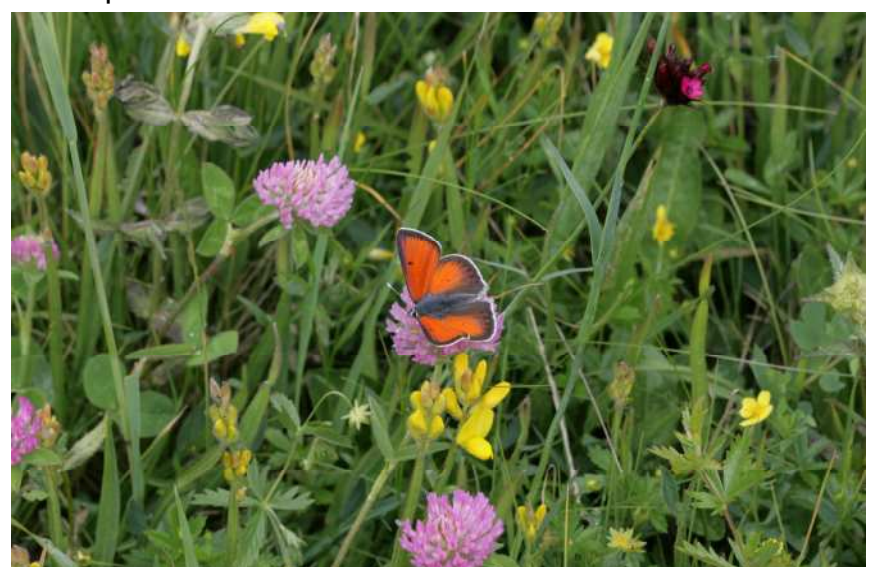
Balkan Copper (Lycaena candens)

Heritage Site which was a Princes Reserve as early as 1870. From 1600 metres the Tara canyon drops to 300 metres, on this occasion a misty bottom. We walked through a native conifer forest to flowerfilled alpine meadows where (Coenonympha rhodopensis) were just climbing up the herb stems. Its hind wing polygon patch was the consistent diagnostic as its hindwing spots varied from zero through to five large ones. Flowers here included Cow-wheat. Bladder Gentian and Yellow Wood Violet