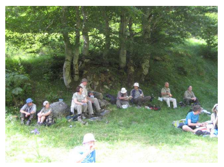
Group enjoying lunch

We were greeted by sun and cloud and wonderful views all around us on this day spent in the area around Gavarnie. This is a species rich part of the Pyrenees and we were not disappointed. Nets were in action early and group discussion became earnest as species after species were shown. Marbled Skipper ( C. levatherae ) was quickly identified, others less speedily agreed, a Swallowtail ( P. machaon ) was seen and then Apollo ( P. apollo ); in addition to the 'Blues' we had seen the previous day we noted Small ( Cupido minimus ), Chalkhill ( Polyommatus corydon ) and Amanda's Blue ( Polyommatus amanda ). Bright-eyed ( Erebia oeme ) and Yellow-spotted Ringlet ( E. manto ) were new species for the trip, as was Woodland Grayling ( Hipparchia fagi ) and Mountain Argus ( Aricia artaxerxes ); both Meadow ( M. parthenoides ) and Heath Fritillary ( M. athalia ) were seen. Rosy Grizzled Skipper ( Pyrgus onopordi ) was identified towards the end of the morning to add to Large Grizzled ( P. alveus ) and Olive Skipper ( P. onopordi ). What we had not seen were Small ( B. selene ) and Pearl-bordered Fritillary ( B. euphrosyne ), nor Alcon Blue ( P. alcon ).