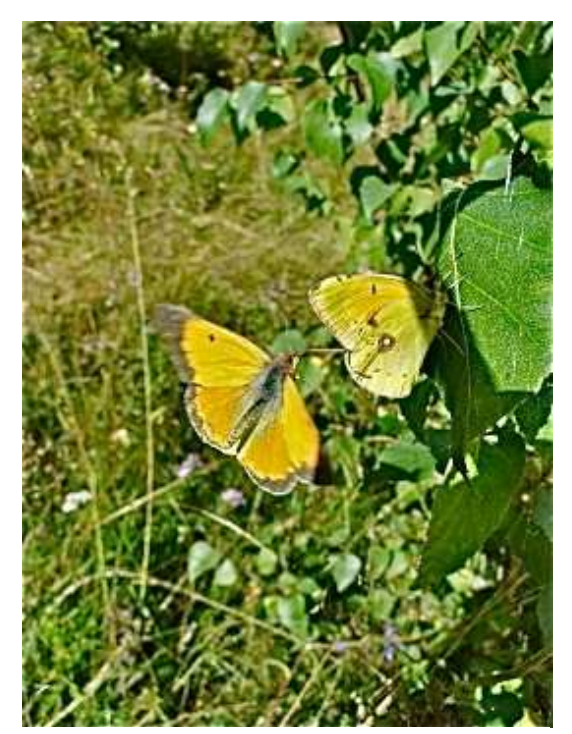
The Danube Clouded Yellow (Colias myrmidone)

The Danube Clouded Yellow ( Colias myrmidone ) is amongst the most endangered butterfly species in Europe (classified as Endangered in the IUCN Red List, with a declining population trend, and Critically Endangered within the EU). With a range extending eastwards into Kazakhstan, the Volga basin and the Urals, it falls into that group of species which are on the extreme western edge of their distribution in Eastern and Central Europe and in common with others such as the False Comma ( Nymphalis vau-album ), seems to have undergone an eastwards regression over recent decades, possibly in response to fluctuations in climate. It is now thought to be extinct in locations such as Germany, Austria and the Czech Republic.