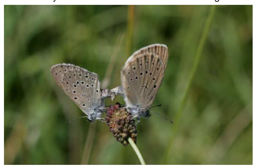
Scarce Large Blue (Phengaris teleius)

<u>July 10<sup>th</sup></u> Back in the Orseg National Park we visited Szalafo and meadows (about 20ha) cut in June for hay removed under National Park Management. Records for NP records were verified