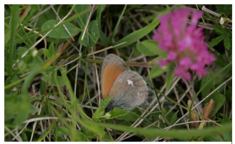
Eastern Large Heath (Coenonympha rhodopensis)

Going north past Niksic we stopped near Vidrovan and visited rocky grazed meadows edged with trees. Great Sooty Satyr ( Satyrus ferula ), Large Tortoiseshell ( Nymphalis polychloros ) and Spotted Fritillary ( Mellitaea didyma var. meridionalis ), the female var with grey forewings replacing the bright orange of the normal form, basked in the hot sun. Many hectares of hayfields were being cut by hand-operated mechanical cutters. The hay is left on the ground to dry in traditional fashion allowing caterpillars to crawl off to the grass and herbs below. 45 species were recorded here in one hour.