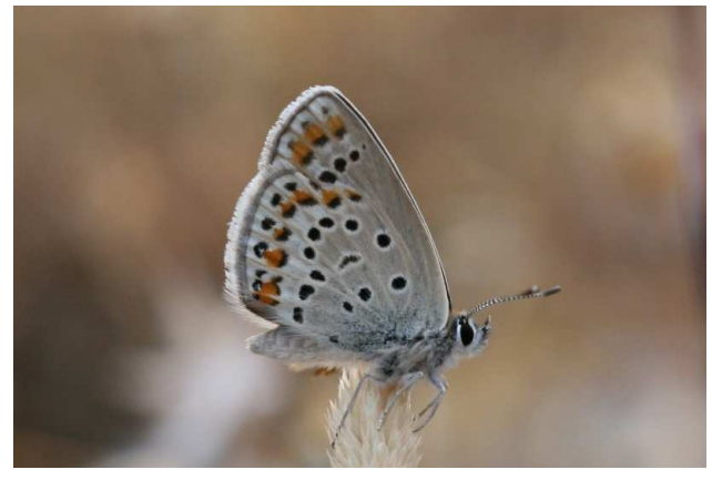
Eastern Brown Argus (Plebejus eurypilus)

As noted in Tolman, Orange-banded Hairstreak is found on Mount Kerkis (= Mt Kerketefs) at 1000m to 1400m. On our first morning we set off up the said mountain in search of our quarry. We were able to take the jeep to about 800m. From there we followed a path towards the summit and after a couple of hours of rather energetic hiking we reached some sheltered slopes at the requisite altitude. There we found several nice specimens of our target species.