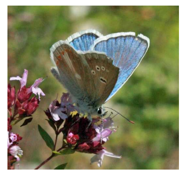
Transylvanian Turquoise Blue ( Polyommatus dorylas magna )

It's not often that you come across a distinctive subspecies of a butterfly that's not mentioned in the common literature, but the Transylvanian Turquoise Blue ( Polyommatus dorylas magna ) is one such example.