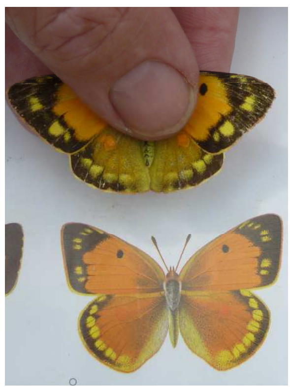
Danube Clouded Yellow ( Colias myrmidone )

The long journey to our target area of Hungarian speaking northern Romania, Transylvania, began early in the morning with little time even for comfort breaks; again our journey was virtually due East. By lunchtime we had crossed the border into Romania and stepped back in time to early 20<sup>th</sup> century Europe. The journey was hampered by numerous horses and carts travelling at a trot through landscapes dotted with Ceausescu's white elephants such as power stations without a coal supply and vast dams creating only a tiny head of water. However the great news was that agriculture operating as had been the case for a century, (we even saw ox carts), required hay instead of petrol to drive the wagons and the pattern of small strip fields in many areas bode well for Lepidoptera.