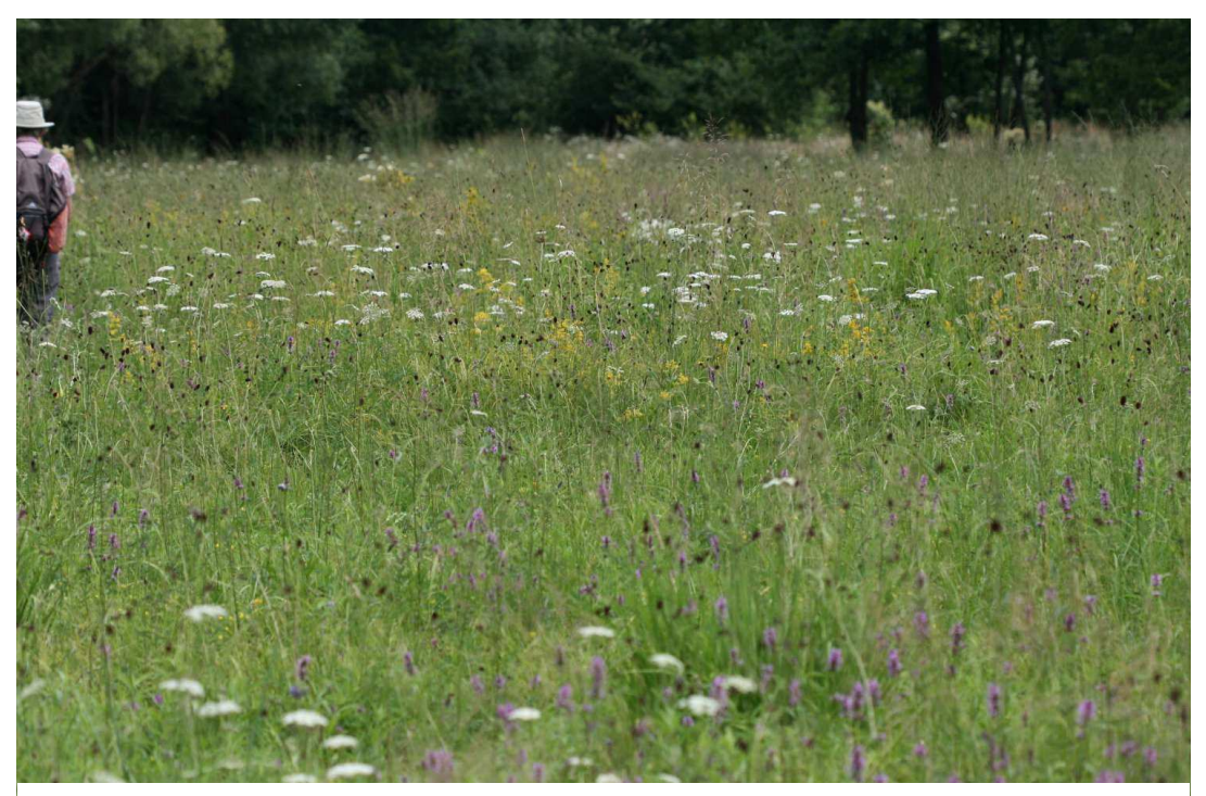
Wet Meadow Kercazsomor

The Hungarian National Heritage Trust organised a butterfly and habitat visit to the far west of Hungary. Their own land is at Kercazsomor in the Orseg National Park. 2 sites near Lake Balaton were also included.