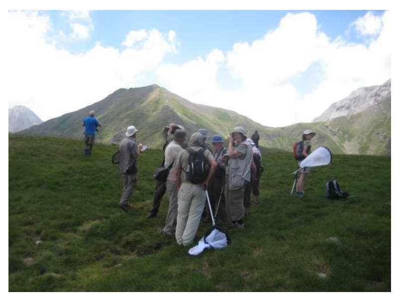
Looking for Gavarnie Ringlet (Erebia gorgone) Col de Tentes

The European Interests Group (EIG) of Butterfly Conservation organizes or coordinates visits by its members to locations around Europe where team effort can help with habitat improvement and enhance the quality of search, recording and monitoring of butterflies. particularly notable species as defined by the IUCN. In this case the objective was to establish records, rigorously checked and verified, in the departments of the Haute Pyrenees (65) and Ariege (09), to add to the information required to produce a distribution atlas for the region of the Midi-Pyrenees.