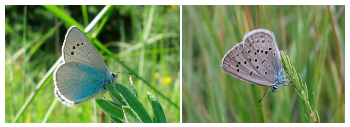
Green-underside Blue Glaucopsyche alexis Alcon Blue Phengaris alcon

Silver-studded Blue ( Plebejus argus ) is abundant on the dunes of the Charente Maritime coast and also occurs locally on grassy sites inland. Idas Blue ( Plebejus idas ) occurs at one site only in the south of Deux-Sèvres but Reverdin's Blue ( Plebejus argyrognomon ) is normally abundant wherever its larval foodplant, crown vetch, grows; Mazarine Blue ( Cyaniris semiargus ), is often abundant in natural or semi-natural grassland. Geranium Bronze ( Cacyreus marshalli ) is now well established in the region and is seen most commonly visiting flowers of geraniums in towns and villages in the west