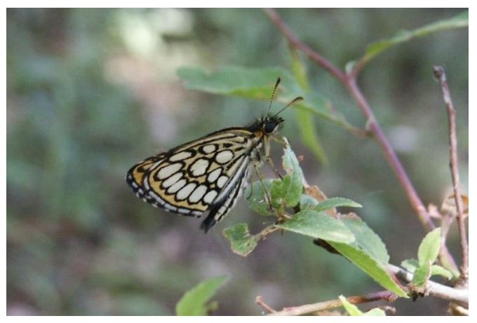
Large Chequered Skipper Heteropterus morpheus

Pieridae : Black-veined White ( Aporia crataegi ) is locally common in a range of habitats but Western Dappled White ( Euchloe craemeri ) is largely restricted to the coast of CharenteMaritime, the first individuals appearing in April. There are no recent records of Bath White