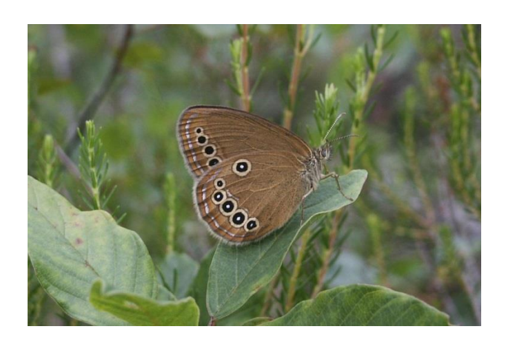
False Ringlet Coenonympha oeidippus

Best months: May is probably the month when, given some sunshine, one can see the largest number of species. June and July are excellent, too. The diversity is rather less in August and September though there are still good things to be seen. If you are interested in seeing particular species or you'd like more specific advice on sites to visit, then ask me. I will be happy to assist bone-fide EIG members in confidence.