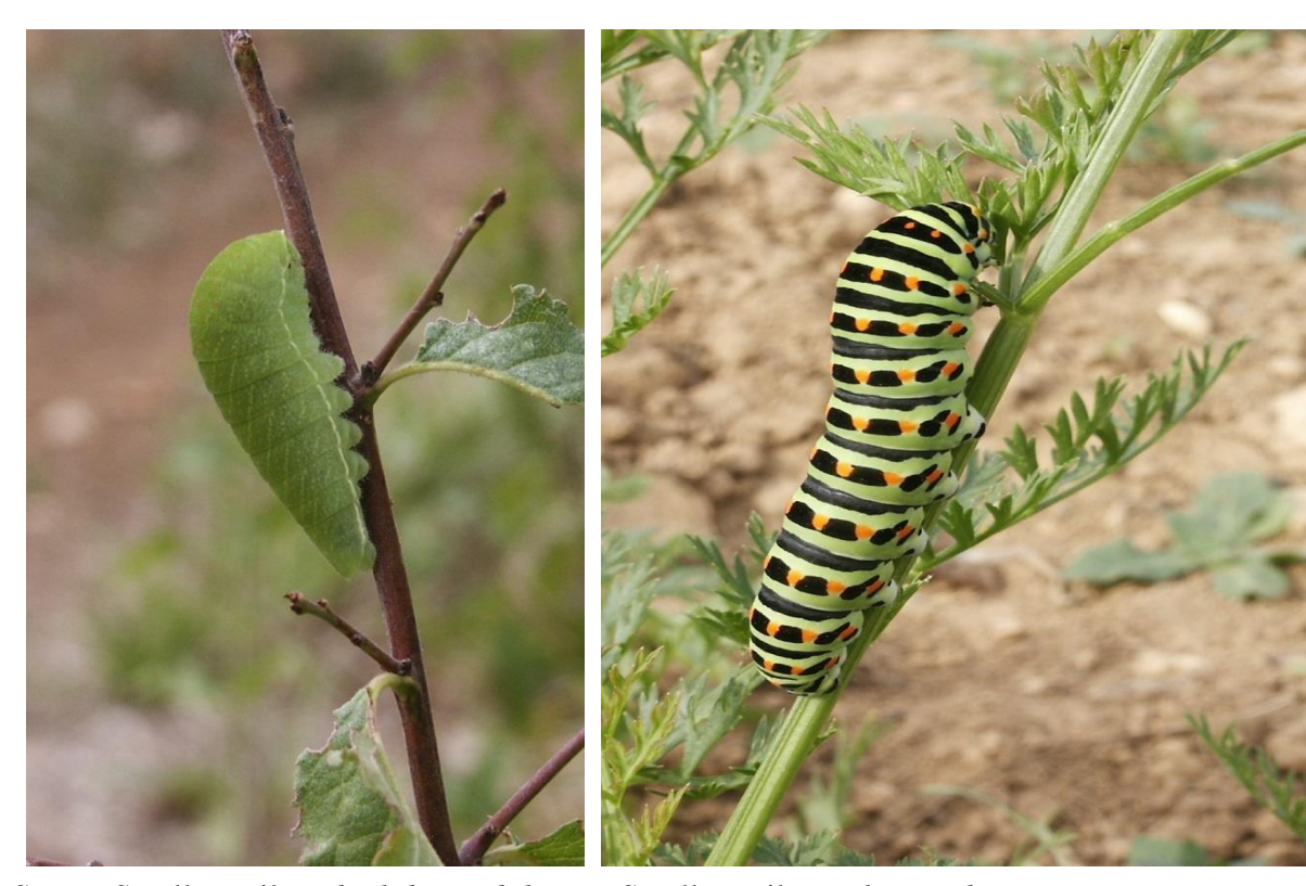
Scarce Swallowtail Iphiclides podalirius Swallowtail Papilio machaon

Lycaenidae : The hairstreaks are well represented with 3 Satyrium species - Ilex Hairstreak, ( S. ilicis ), Sloe Hairstreak ( S. acaciae ) and Blue Spot Hairstreak ( S. spini ) in addition to the British ones. These occur in June but only Ilex Hairstreak is reasonably abundant (in scrubby woodland). The others are very local.