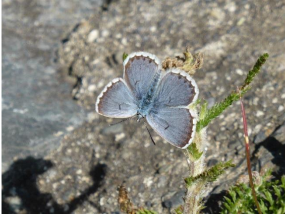
Baton Blue Pseudophilotes baton