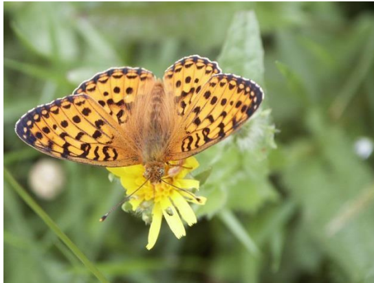
Dark Green Fritillary Argynnis aglaja