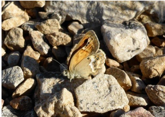
Dusky Heath Coenonympha dorus

Two ringlets, in addition to the UK species, are mentioned as being present, neither of which have I seen in the department: Autumn and Piedmont ( Erebia neoridas , meolans ). The same might be said to apply to the marbled whites: our own Marbled White, Esper's and Western ( Melanargia galathea , russiae , occitanica ), where I have not sighted either of the latter two in the Lot.