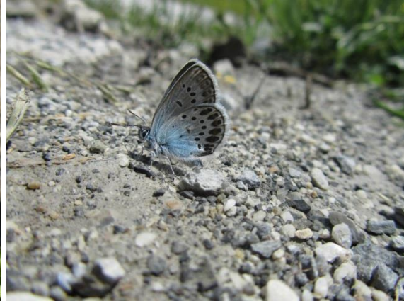
Silver-studded Blue Plebejus argus

The Blues are also present in a wide diversity with Large Blue ( Phengaris arion ) to be seen in moderate numbers across the department in the second half of June. Adonis Blue ( Polyommatus bellargus ) appears to be common and widespread, whilst Chalk-hill Blue ( Polyommatus coridon ) is not, just as in the Dordogne. In addition to other UK Blues, there are good and widespread populations of Provencal Short-tailed Blue ( Cupido alcetas ), at lower densities Green-underside Blue ( Glaucopsyche alexis ), Long-tailed Blue ( Lampides boeticus ), Chapman's and Escher's Blues ( Polyommatus thersites , escheri ) although I have been unable to confirm the latter. Chequered Blue ( Scotilantides orion ) has also been recorded here but the nearest I have seen it is in the Cantal, just as for Purple-shot Copper. If you get the location and timing right, Baton Blue ( Pseudophilotes baton ) can be seen in reasonable numbers, as can be Silver-studded and Idas Blues ( Plebejus argus , idas ) but none of these is widespread. Of course, you may come across Geranium Bronze ( Cacyreus marshalli ) almost anywhere near habitations displaying colourful potted geraniums, including town centres!