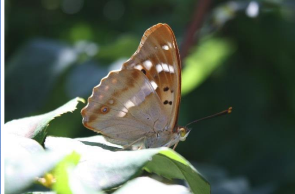
Great Banded Grayling Brintesia circe