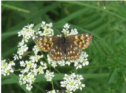
Duke of Burgundy Hamearis lucina