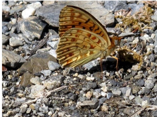
High Brown Fritillary Argynnis adippe (form cleodoxa)

I have not found Pearl-bordered Fritillary ( Boloria euphrosyne ) in the Lot despite hours of searching what I believed to be suitable habitat; the same was the case for Small Pearl-bordered Fritillary ( Boloria selene ) until I was able to photograph and confirm the species at a site we visited on a fairly regular basis – a question of getting the timing right! Violet or Weaver’s Fritillary ( Boloria dia ) is widespread and multi-brooded, and usually the first fritillary of the year to appear.