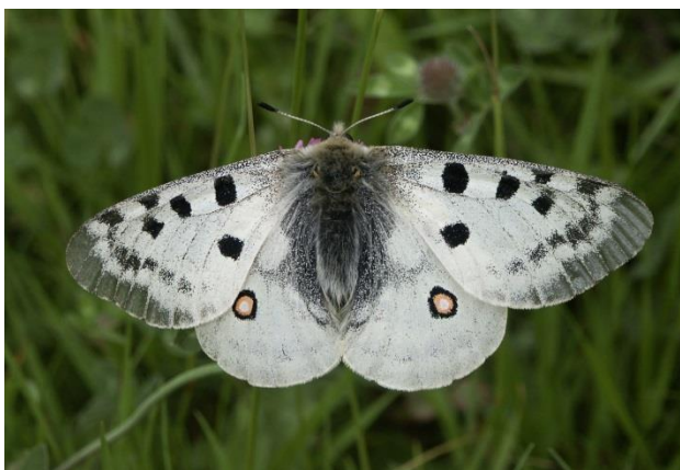
Apollo Parnassius apollo

Target species: Provencal Chalkhill Blue ( Polyommatus hispana ), Chequered Blue ( Scolitantides orion ), Two-tailed Pasha ( Charaxes jasius ) (I have only seen it twice in ten years), Portuguese Dappled White ( E tagis ) (I have only seen it once). Also to be seen from time to time is the Large Tortoiseshell ( Nymphalis polychloros ). In June the Ilex Hairstreak ( Satyrium ilicis ), False Ilex Hairstreak S. esculi ) and Blue-spot Hairstreak ( S. spini ) are common.