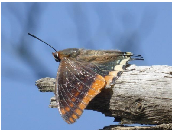
Two-tailed Pasha Charaxes jasius