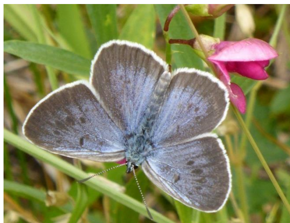
Provence Chalk-hill Blue Polyommatus hispana