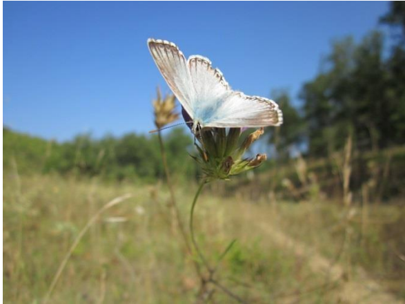
Provence Chalk-hill Blue Polyommatus hispana