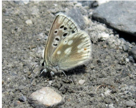
Gavarnie Blues Agriades pyrenaicus

Coppers: Purple-edged Copper ( Lycaena hippothoe ) and Scarce Copper ( L. virgaureae ) are very well represented, the Purple-shot Copper ( L. alciphron ) can be found in small localised colonies, usually in the gordius form. The Large Copper ( L. dispar ) can be found in damp meadows but only at lower altitudes.