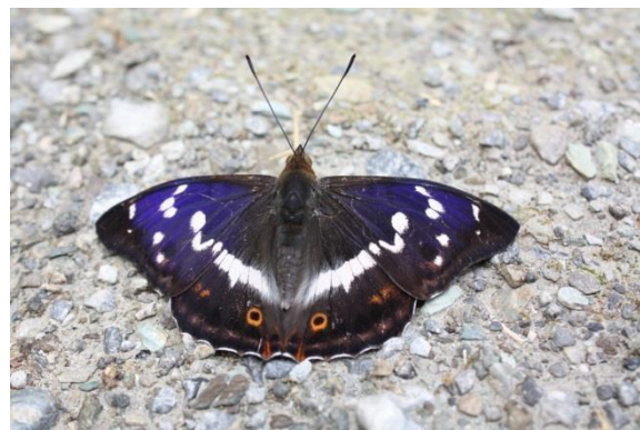
Purple Emperor Apatura iris