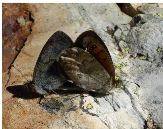
Common Brassy Ringlets Erebia cassioides