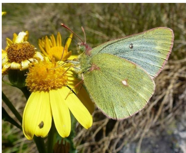
Mountain Clouded Yellow Colias phicomone

Mountain Clouded Yellow ( Colias phicomone ) - very localised colonies in grassy rocky outcrops.