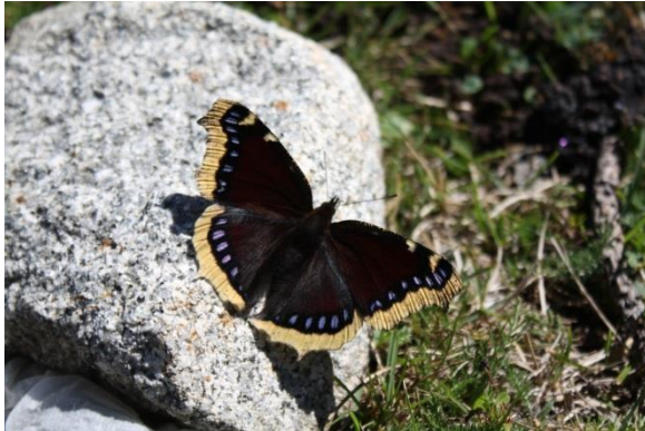
Camberwell Beauty Nymphalis antiopa