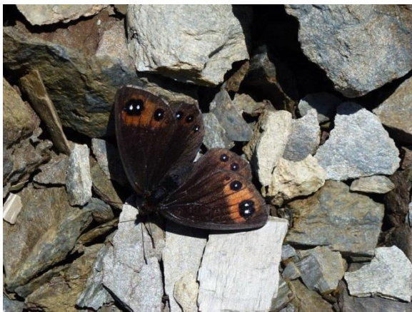
Lefèvre's Ringlet (female) Erebia lefebvrei

The Gavarnie Ringlet is usually found above 1800m. Pyrenees Brassy Ringlets are found from 1600m; males can be found in large numbers ‘puddling’ on damp ground or at the edge of streams. They have fore-wing upper sides containing two fused black spots with bright white pupils which are also present on the fore-wing under side. This area of the Pyrénées is one of the few remaining places in Europe where you can find both Common and Pyrenees Brassy Ringlets flying together.