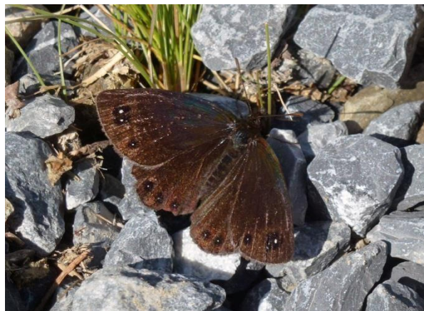
Lefèvre's Ringlet male Erebia lefebvrei