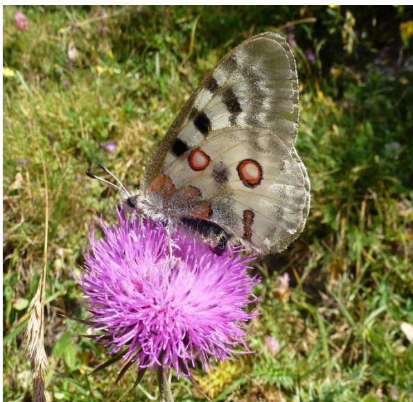
Apollo Parnassius apollo