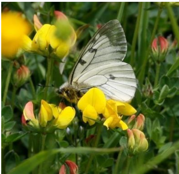
Clouded Apollo Parnassius Mnemosyne