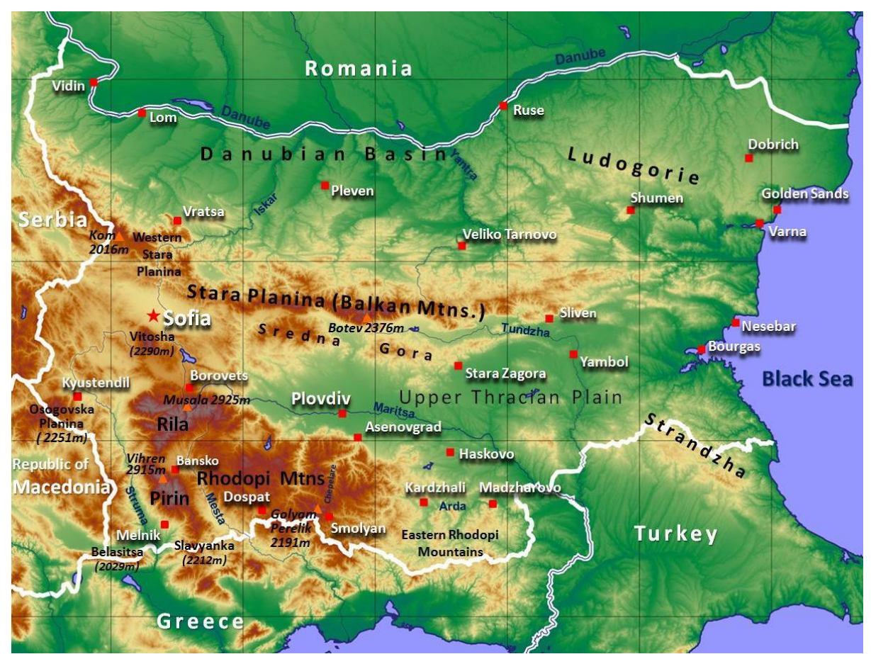
Map 1. Shows the whole country of Bulgaria with its topography (including highest peaks in each mountain range) and some the main cities and towns. (Adapted from map licensed under free commons on Wikipedia).

this it is possible to walk almost anywhere in rural areas without restriction. I have very rarely been stopped and questioned. However it is important to walk carefully between crops and not to trample hay meadows, which of course form part of the livelihood of local subsistence farmers.