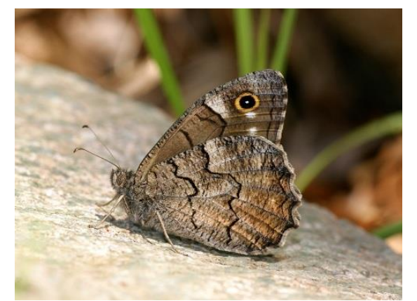
Freyer's Grayling ( Hipparchia fatua ), male. SW Bulgaria, July 2013