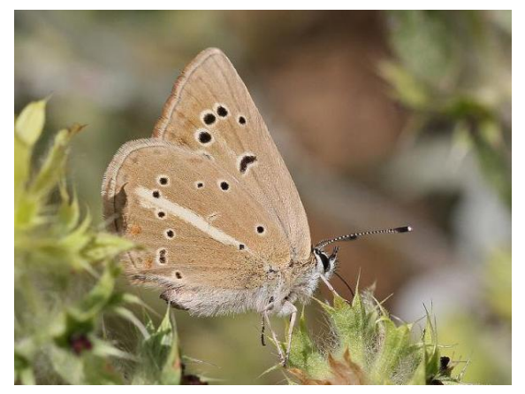
Kolev's Anomalous Blue ( Polyommatus orphicus ) Western Rhodopi, July 2012.

The near endemic <u>Bulgarian Ringlet</u> ( Erebia orientalis ) was previously considered to be a sub-species of the Mountain Ringlet ( Erebia epiphron ). It's range lies almost entirely within Bulgaria, outside of Bulgaria extending just into the Serbian part of the Western Stara Planina. In Bulgaria It occurs very locally above 1900m on open subalpine and alpine grassland in the Rila and Pirin Mountains and in the Central and Western Stara Planina. It is protected by law.