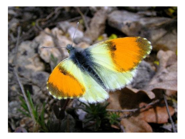
Grüner's Orange-tip ( Anthocharis gruneri ), male. SW Rila Mountains. May 2014 © Nick Greatorex-Davies

Eastern Greenish Black-tip ( Euchloe penia ), male. Northern Greece, May 2014 © Nick Greatorex-Davies