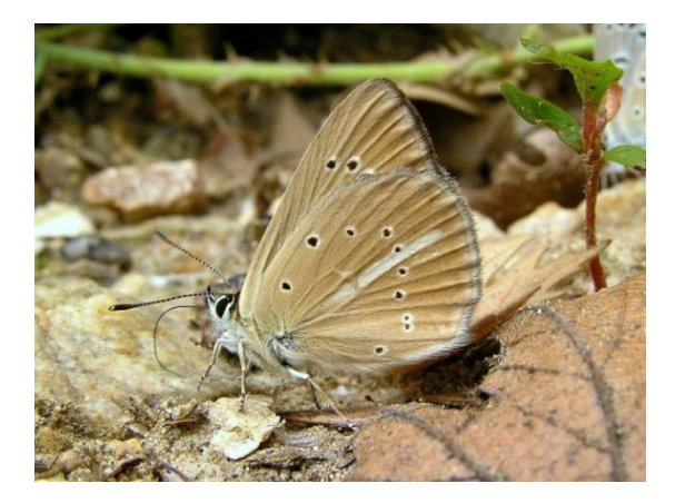
Grecian Anomalous Blue ( Polyommatus aroaniensis ) male. South Pirin, July 2009

Grecian Anomalous Blue ( Polyommatus aroaniensis ). One of many closely related species, it has a very restricted distribution occurring only in Greece, Macedonia and Bulgaria. It is fairly widespread in the mountains of Greece but in Bulgaria it is very localised in calcareous mountain areas from about 700m to about 1700m (Kolev), only being known from the mountains of Alibotush on the Greek border (also known as Slavyanka Mountain), south Pirin, Western Rhodopi and the Eastern Stara Planina near Sliven. Contrary to what is indicated in some identification guides, this species sometimes has a white stripe on the underside of the hindwing, making it easy to confuse with other closely related species that occur with it. Adults fly from late June to early August. Larvae feed on the sainfoin Onobrychis ebenoides .