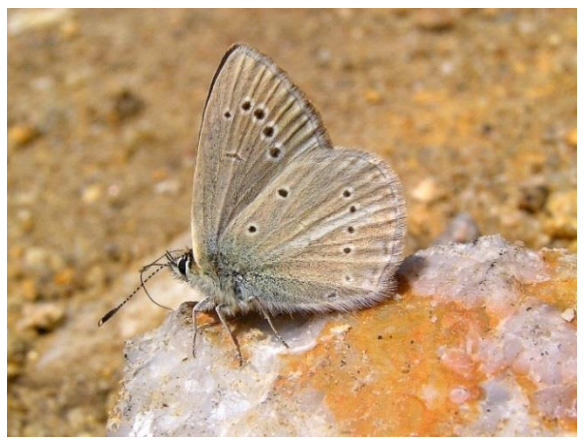
Higgins Anomalous Blue ( Polyommatus nephohiptamenos ) male. South Pirin, July 2008

Kolev's Anomalous Blue (Polyommatus orphicus). This species was first described by Zdravko Kolev (2005). It is very difficult to distinguish from other similar species in the field. It is only known from rocky calcareous areas in the Rhodopi mountains, all but one site in Bulgaria, the other site being in northern Greece.