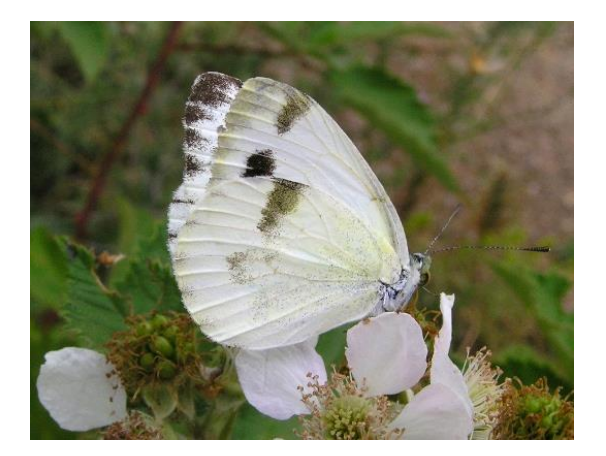
Krueper's Small White ( Pieris krueperi ), male. Eastern Rhodopi. June 2010