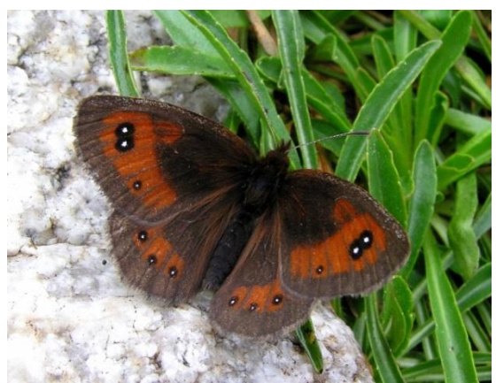
Nicholl's Ringlet ( Erebia rhodopensis ), male. SW Rila Mountains