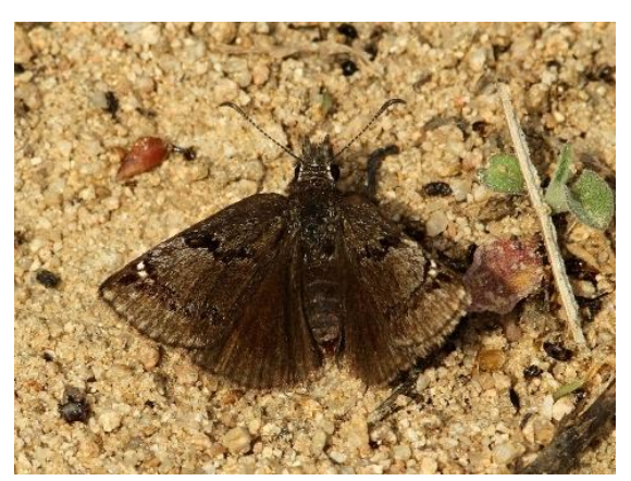
Inky Skipper ( Erynnis marloyi ). SW Bulgaria. May 2015