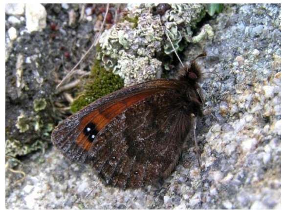
Nicholl's Ringlet ( Erebia rhodopensis ), male. SW Rila Mountains

Nicholl's Ringlet ( Erebia rhodopensis ). This species is only known from a few isolated high mountain areas in Bulgaria, on the Greek-Albanian border, the Macedonia-Serbian border and the Serbian-Albanian-Montenegro borders. In Bulgaria it is widespread but local on open alpine grassland at high altitudes in the Rila and Pirin Mountains and in the central Stara Planina above 1900m. It can be abundant where it occurs. It flies in July. It was previously considered to be a sub-species of the False Mnestra Ringlet ( Erebia aethiopella ). It is also superficially similar to the Silky ringlet ( Erebia gorge ), (which also occurs in Bulgaria), but it occurs on open grassland not rocky scree and pinacles like the latter species. It is protected by law.