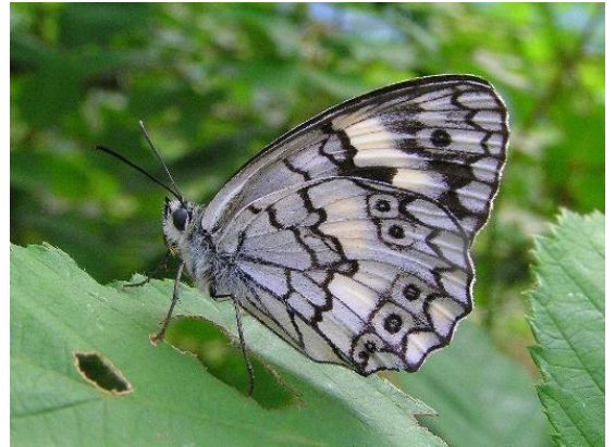
Balkan Marbled White ( Melanargia larissa ), male. Eastern Rhodopi. June 2014