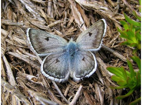
Bosnian Blue ( Plebejus dardanus ), male. Central Pirin, July 2011