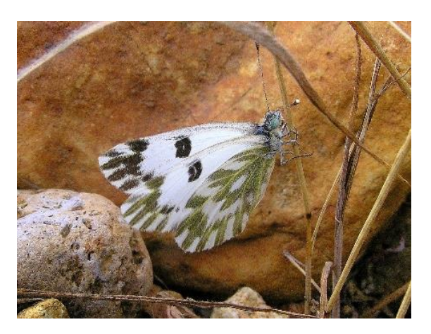
Small Bath White ( Pontia chloridice ), male. SW Rila Mountains. June 2013