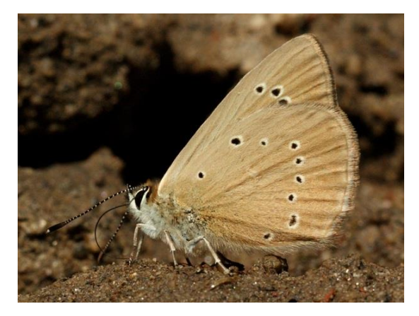
Grecian Anomalous Blue ( Polyommatus aroaniensis ) male. South Pirin, July 2008