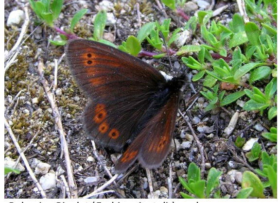
Bulgarian Ringlet ( Erebia orientalis ), male. Belmeken, Rila Mountains, July 2008

The near endemic <u>Bulgarian Ringlet</u> ( Erebia orientalis ) was previously considered to be a sub-species of the Mountain Ringlet ( Erebia epiphron ). It's range lies almost entirely within Bulgaria, outside of Bulgaria extending just into the Serbian part of the Western Stara Planina. In Bulgaria It occurs very locally above 1900m on open subalpine and alpine grassland in the Rila and Pirin Mountains and in the Central and Western Stara Planina. It is protected by law.