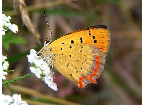
Grecian Copper ( Lycaena ottomana ), male. Strandzha, June 2012