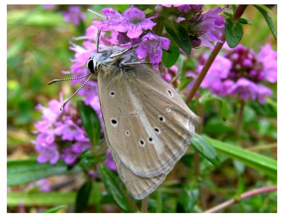
Higgins Anomalous Blue ( Polyommatus nephohiptamenos ) male. South Pirin, July 2010

<u>Higgin's Anomalous Blue</u> ( Polyommatus nephohiptamenos ) is very similar to the preceding species, but has an even more restricted range, occurring very locally from about 1400m to about 2100m (Kolev) on calcareous mountains in a small area of northern Greece (Mt. Falakron and Mt. Orvilos), and in SW Bulgaria on Mt. Alibotush and central Pirin. It flies in July and August. The larvae feed on sainfoins ( Onobrychis spp.)