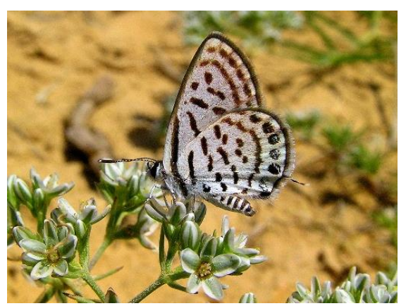
Little Tiger Blue ( Tarucus balkanicus ), male. Eastern Rhodopi. June 2011