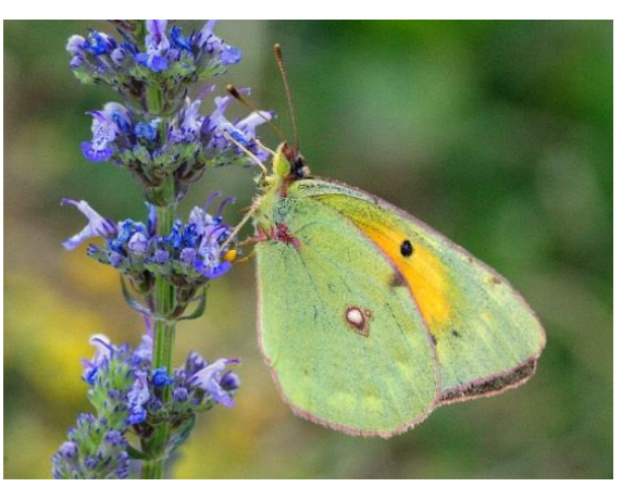
Balkan Clouded Yellow ( Colias caucasica ), female. Osogovska Planina, July 2013

western Greece, Macedonia, and in the Dinaric Alps in Montenegro and Bosia-Herzegovina. In Bulgaria it is found above about 1100m to about 2200m (Kolev) very locally in the Rila Mountains, but also on Vitosha Mountain, just south of Sofia, and in the Osogovska Planina on Bulgaria's western border with Macedonia. Among other differences it has deeper orange uppersides than its common congener the Clouded Yellow ( Colias crocea ), nevertheless females can sometimes be hard to distinguish. It flies in June and July in areas where its bushy hostplant, Chamaecytisus absinthioides is abundant. It is protected by law.