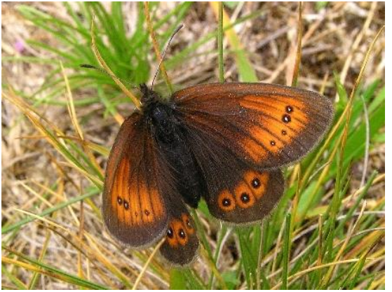
Bulgarian Ringlet ( Erebia orientalis ), female. Western Stara Planina, July 2014